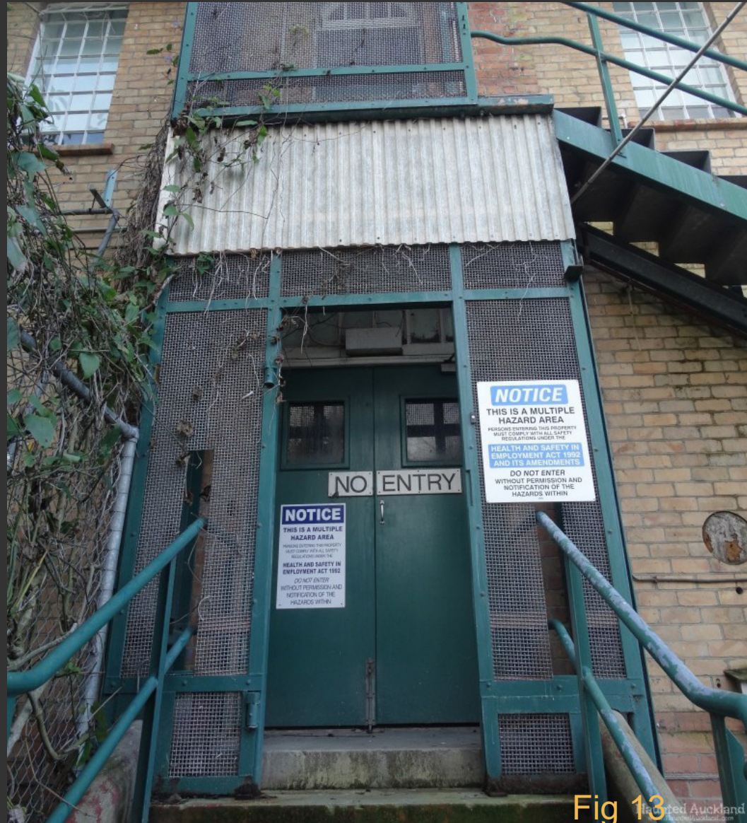
Fig 13

It may also be beneficial to look at the psychology of working in these areas