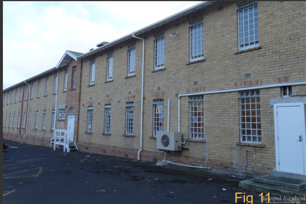
Fig 11 Haunted Auckland www.hauntedauckland.com

I have also been made aware of several book binding techniques as well as where to find more information on them